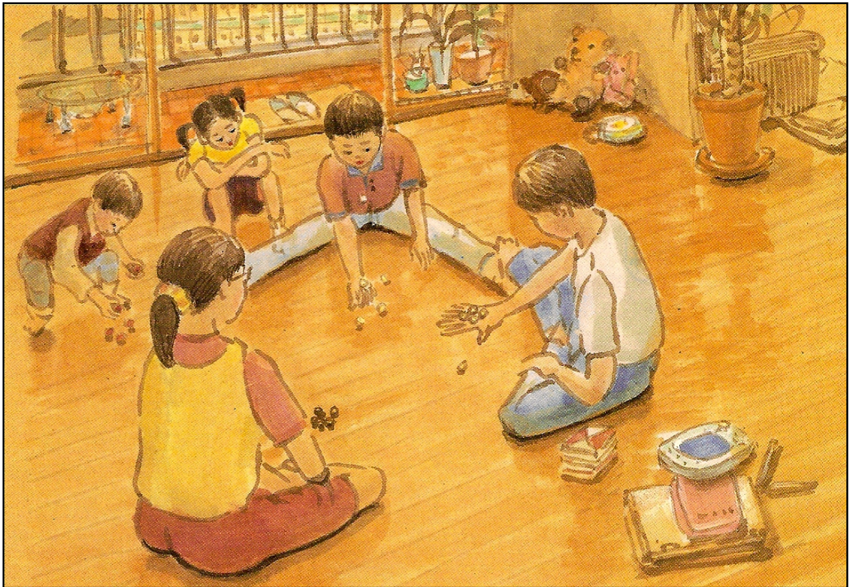
Children playing gonggi